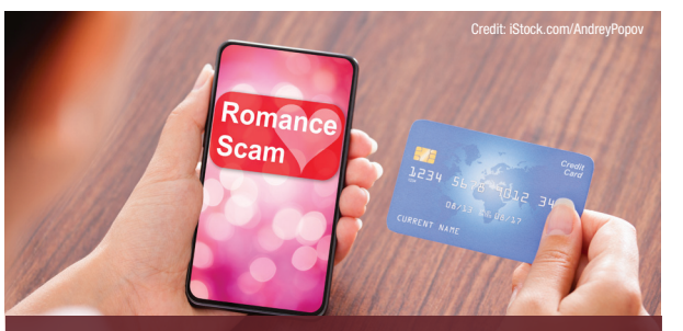
A romance scam is a form of confidence scam whereby a scammer gains the trust of a victim by developing a romantic relationship. This relationship usually begins through contact on social media or dating applications.